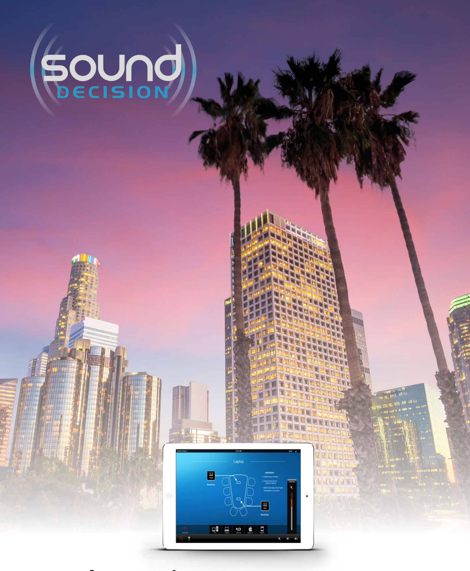
Electronic Systems Integrators